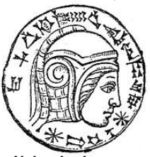
Nebuchadnezzar 605-562 BC